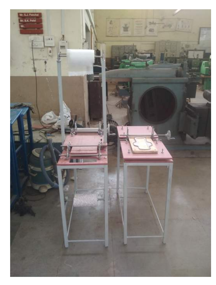
Prototype Development of low-cost sanitary pad manufacturing machine