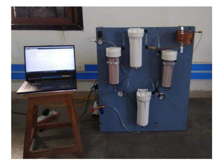
Fabrication of Oxygen Concentrator Prototype